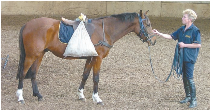
Principal Cheski's approval of a lesson respectfully learnt.